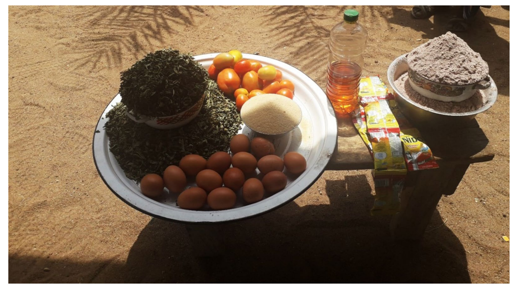
Fig. 1 A sample of food basket to be redeemed by an eligible caretaker in Mourbaré district